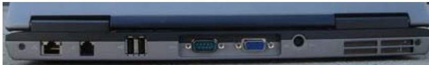
Back side view of ports on the D620: Ethernet LAN and Modem, 2 USB 2.0 ports, Serial port, VGA out port, Power port, Fan and Vents ( view large image )