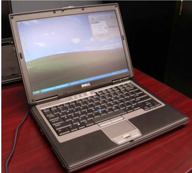
Dell Latitude D620 ( view large image )

The Dell Latitude D620 is a 14-inch widescreen business notebook equipped with the latest Intel Core Duo processor. The D620 replaces the D610 and provides quite an overhaul in both design change and internal components. The new industrial charcoal grey and black look of the D620 conveys its strong build, which Dell calls "Road Ready", and with a slew of available built-in wireless communications this notebook is road ready in more ways than one.