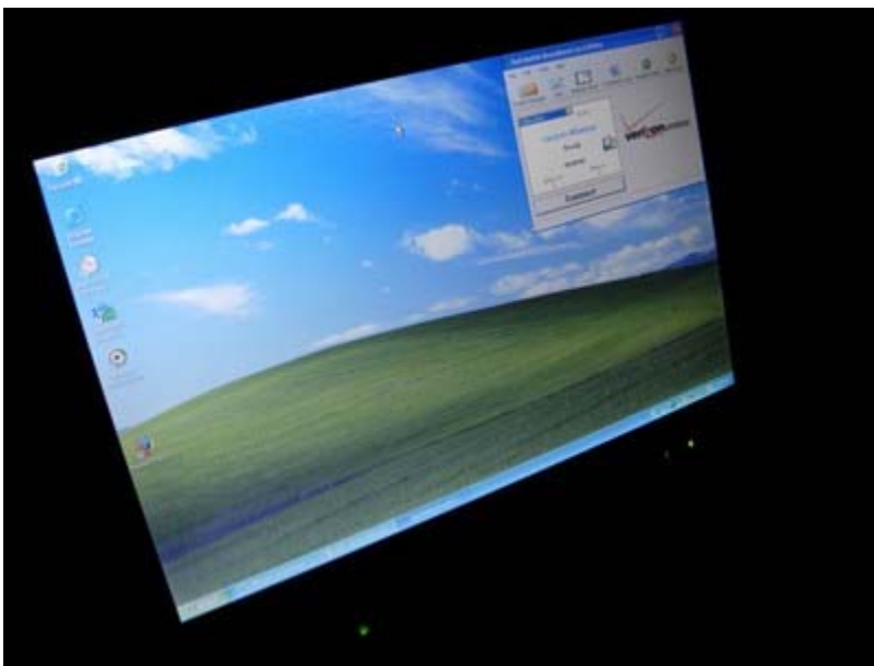
Dell D620 screen ( view large image )

The D620 is offered with a WXGA (1280 x 800) or WXGA+ (1440 x 900) display. The WXGA+ will give you about 26% more screen real estate. As mentioned before, Dell is adopting the widescreen format with the thinking that it allows business users to more easily display side-by-side document windows. The widescreen format also offers a lower overall profile, this is good for in tight spaces such as a plane, and actually means the notebooks footprint is about 2% less overall.