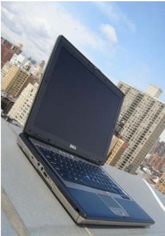
(view large image)