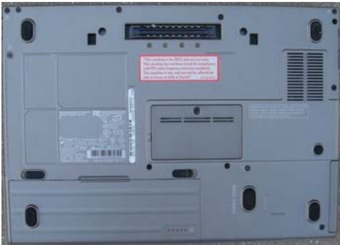
Underside view of the D620: Expansion slot (at the back), battery (at the front), memory slot in the middle ( view large image )

I would like to have seen an separate Express Card/54 slot and a media card reader -- or SD card reader at least. The Smart Card reader and Serial connector are obviously not going to appeal to consumers, but could be valuable to some businesses that utilize such ports. It would have been nice to have either an S-Video or DVI-D port as well, although given this is a business notebook it's forgivable for not being there.