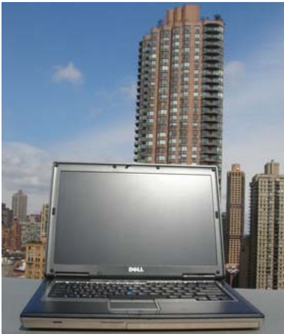
(view large image)