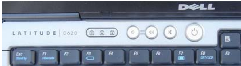
Close in view of volume and power button ( view large image )

input. I find the pointing stick to be faster and easier to use than the touchpad, but if you prefer a touchpad then it's there and is a very generous size for easy use. The dual mouse buttons have a nice feel and positioned so that if you use the pointing stick you would use the uppermost buttons and if you use the touchpad you would use the lowermost buttons.