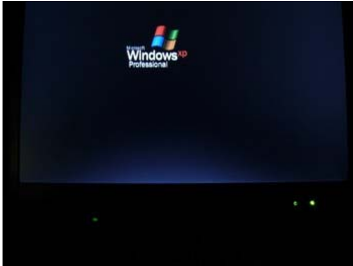
The D620 screen does experience some light leakage at the bottom ( view large image )

As far as screen quality, the brightness is decent, but certainly not the best on the market and nowhere near as vivid as some of the high-end screens for consumer notebooks. It is a matte screen so you won't get any reflection from office lighting. There is some backlight leakage from the bottom and the overall picture is slightly washed out. Below are some pictures of the screen in the dark, notice the light leakage from the bottom on the all black Windows XP screensaver background.