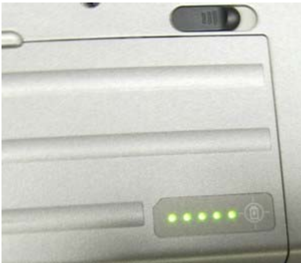
The battery has a built-in charge indicator on the D620 ( view large image )

The D620 can be configured with a 4-cell, 6-cell or 9-cell battery. The battery location is rather odd relative to other notebooks in that it is at the front and not the back of the laptop. If you get an extended life 9-cell battery it will stick out of the front a bit and create a sort of lip that extends 0.9". I have the 6-cell type battery and it does not stick out at all. With wi-fi on and screen at mid-brightness and doing tasks such as web browsing and emailing I got 2h 36m of battery life. That's decent, but not great. There are certainly thin-and-lights with better and I prefer to see 3 hours or a little more for a thin-and-light travel notebook. If you were to upgrade to the 9-cell you would certainly exceed 3 hours, but at the cost of extra weight and increased notebook size.